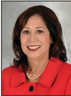
Hilda L. Solis 1st District