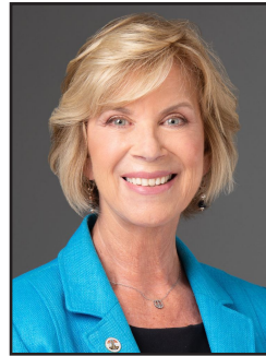
Janice Hahn 4th District