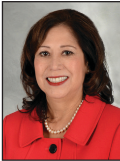
Hilda L. Solis 1st District