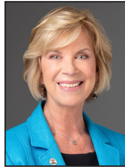
Janice Hahn 4th District