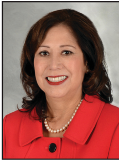
Hilda L. Solis 1st District